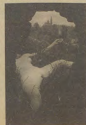
Marcel Duchamp, Étant donné... II (1917, bronce, 20 x 10 x 10 cm).

La ejecución, la superficie, el volumen, es lo que le permite presentar la escena en un nivel de apariencia o de apariciones momentáneas y fragmentadas. A través del recorrido visual de la obra, lo que vemos en esta escena aparente, es solamente eso, la apariencia de una escena. En realidad la imposibilidad de salir como una totalidad se debe al hecho de que ella ha sido