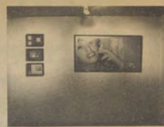
Rodrigo Méndez, ABRIR y CERRAR (1998, fotografía de la obra y video sobre instalación, pintura y metal, 200 x 300 cm).

Hago esta relación para referirme al papel que tendrá el trabajo de Duchamp en las artes