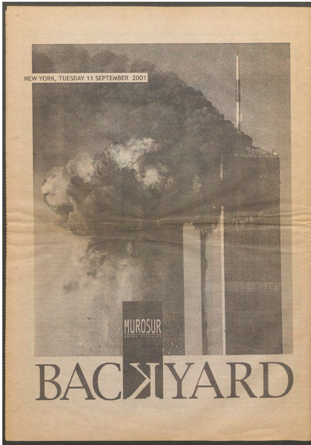
Fig. 4a, 4b Muro Sur — Artes Visuales: Backyard , cover and back cover of issue 3, 11 September 2003.