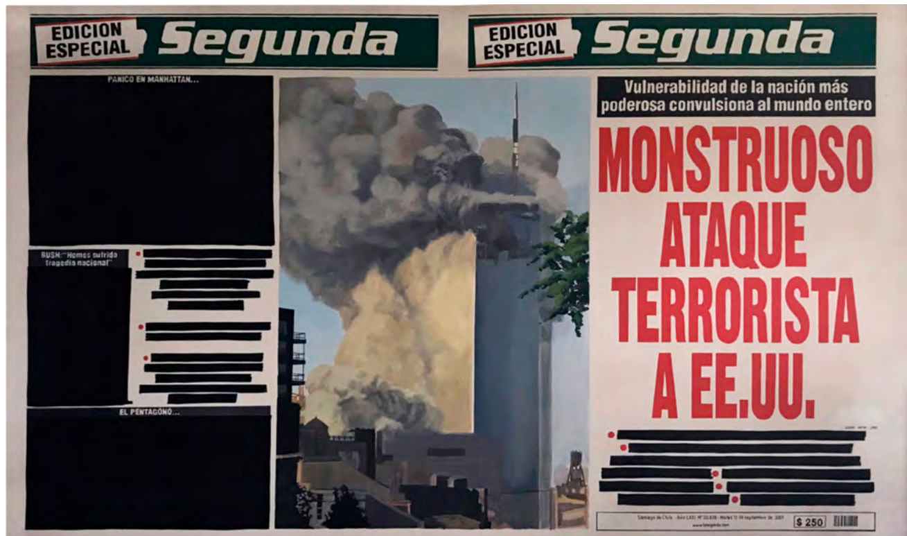
Fig. 5 Voluspa Jarpa, Desclasificados , 2005.

a question: ‘Could there be such a thing as documentary painting as opposed to representational painting?’ (Jarpa quoted in Pérez Rubio 2018: 25). Or, in other words: ‘How can the declassification of archives be made visible and, therefore, represented — symbolised?’ (Jarpa 2024: 421–422). In 2003, Jarpa’s contribution to Backyard — which was not attributed in the publication — consisted of reproducing some declassified documents so literally as possible, transcribing part of their contents, and adding two quotes taken from bibliographic sources that delved into the issue of US interference in Chilean contemporary politics.